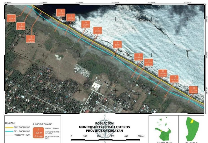
Fig. 2. Shoreline Retreat for the past 14 years.

Fig. 2 used a satellite image from 2007 and it shows the location of the shoreline from that year and its landward movement over the years. The shoreline was represented by a