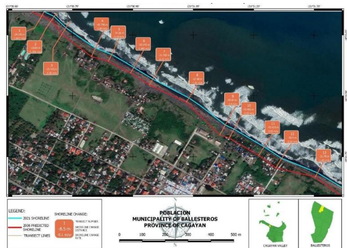
Fig. 3. Predicted Shoreline in 15 years

It was found that the area covered by the displacement is approximately forty-eight thousand five hundred eighty-four (48,584) square meters, more or less. This signifies that approximately 5 hectares have been lost from the land resources of the two barangays namely Centro East and Centro West in the municipality of Ballesteros. This finding is worth informing the LGU of Ballesteros for proper action.