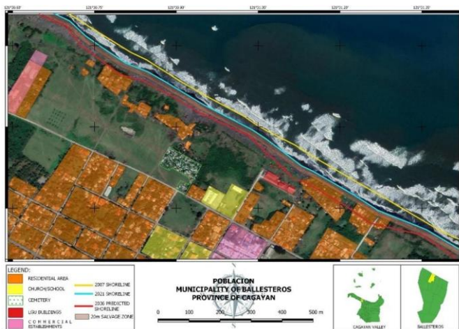
Fig. 4. Predicted Shoreline in 15 years

It was discovered that the displacement of the transect points of the shoreline if there is no human intervention and the rate of change will stay the same of the area that will be lost in Poblacion is fifty-one thousand five hundred seventy (51,570) square meters.